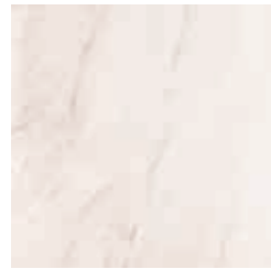
Majestic White 45x45 455x455mm P16