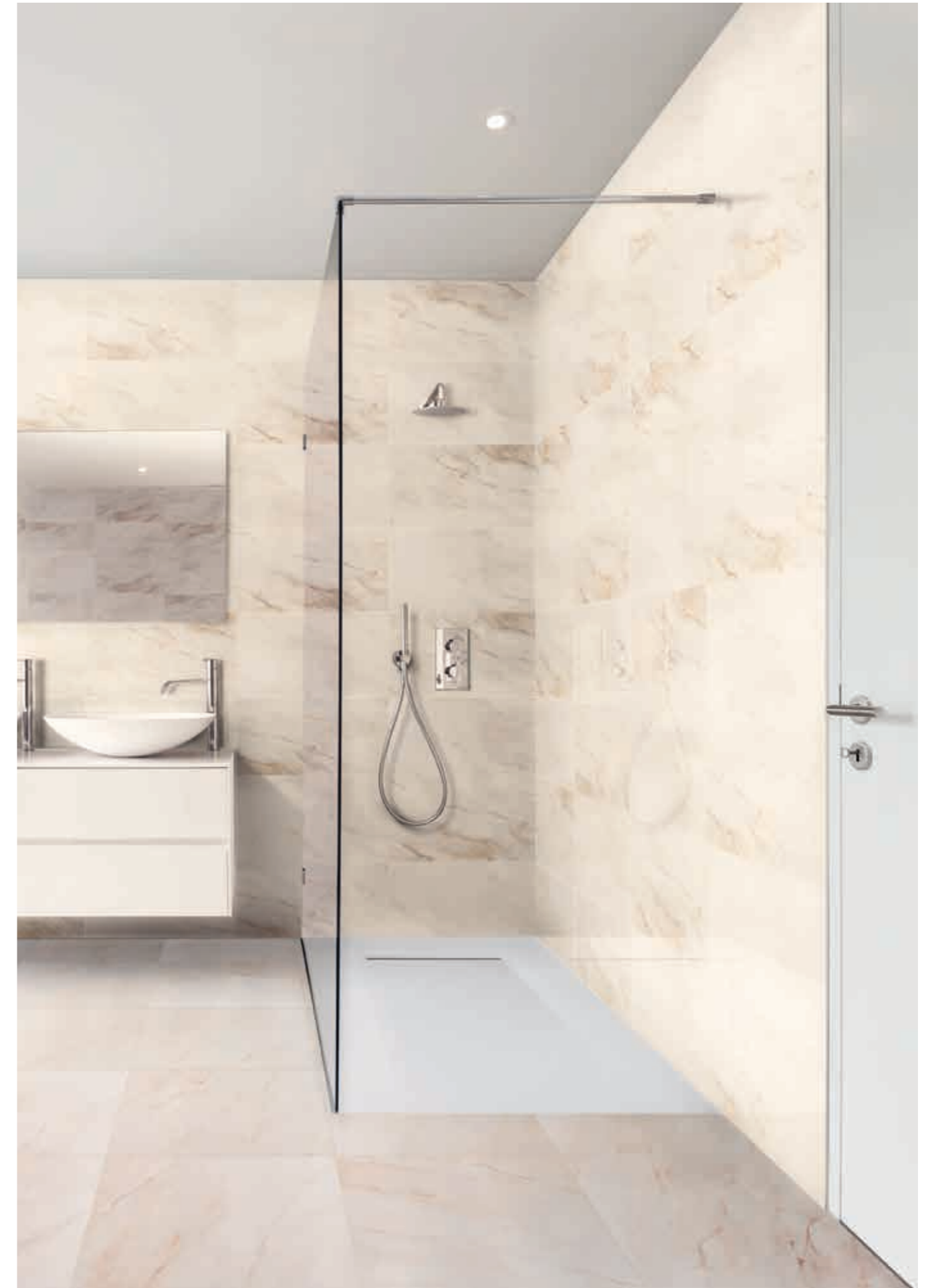
Majestic Beige 30x60 Rev · Majestic Beige 45x45