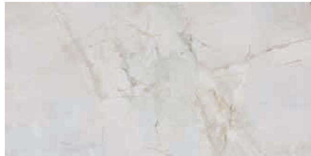
Griseo Nat. Polished 120x60R 1198x598mm R35 R39