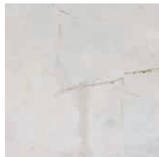
Griseo Nat. Polished 60x60 608x608mm P27 60x60R 598x598mm R24 R33