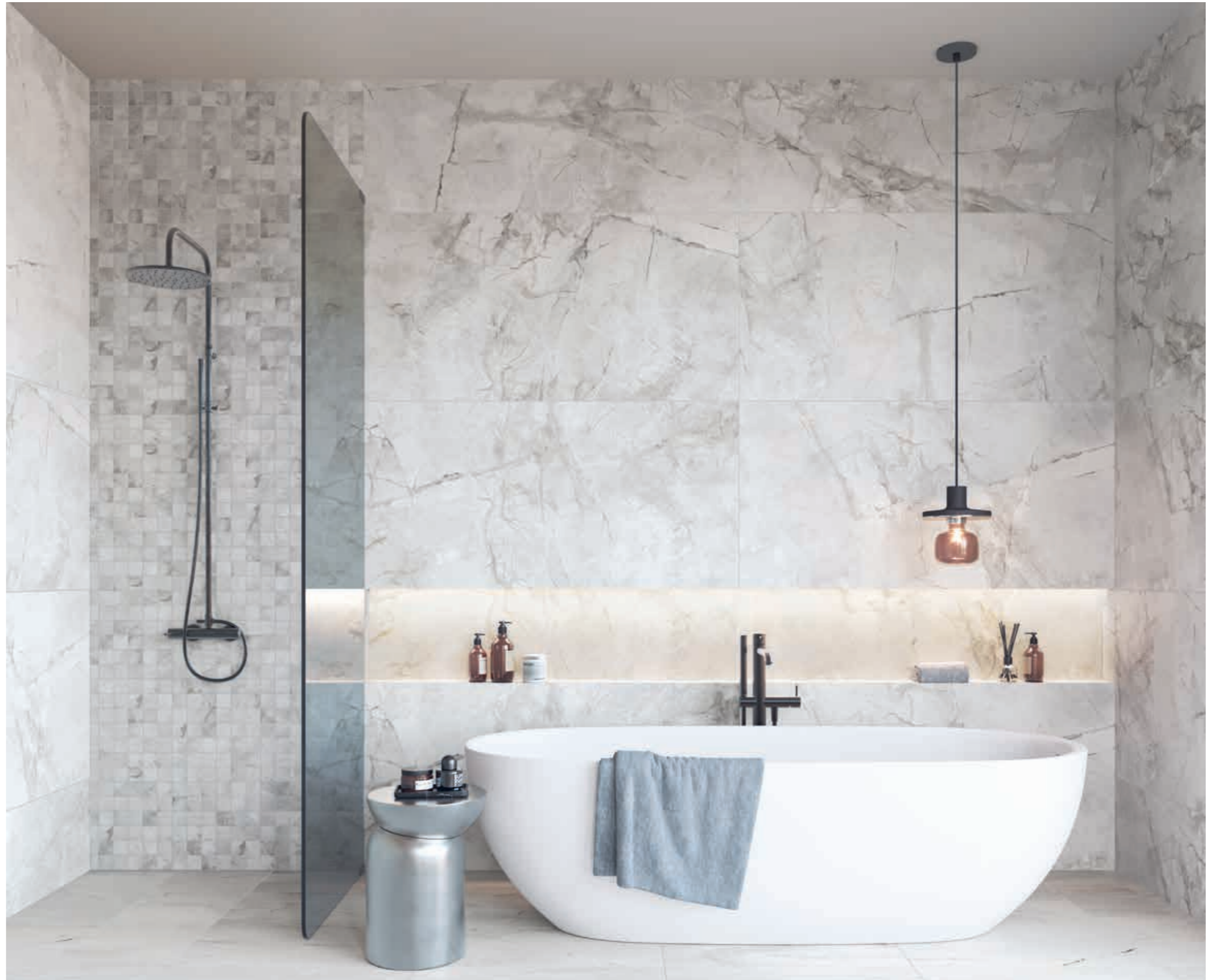
Griseo 120x60R · Griseo 60x60R · Mosaic Griseo (4,5x4,5) 30x30

** Rodapé; Metros lineares · Skirting; Linear meters · Plinthe; Mètres linéaires · Sockelleisten; Laufende Meter