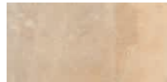
Cotto Beige Nat. 30x60 305x605mm P22