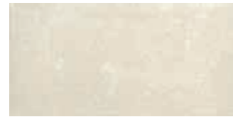
Cotto White Nat. 30x60 305x605mm P22