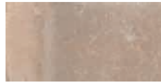
Cotto Greige Nat. 30x60 305x605mm P22