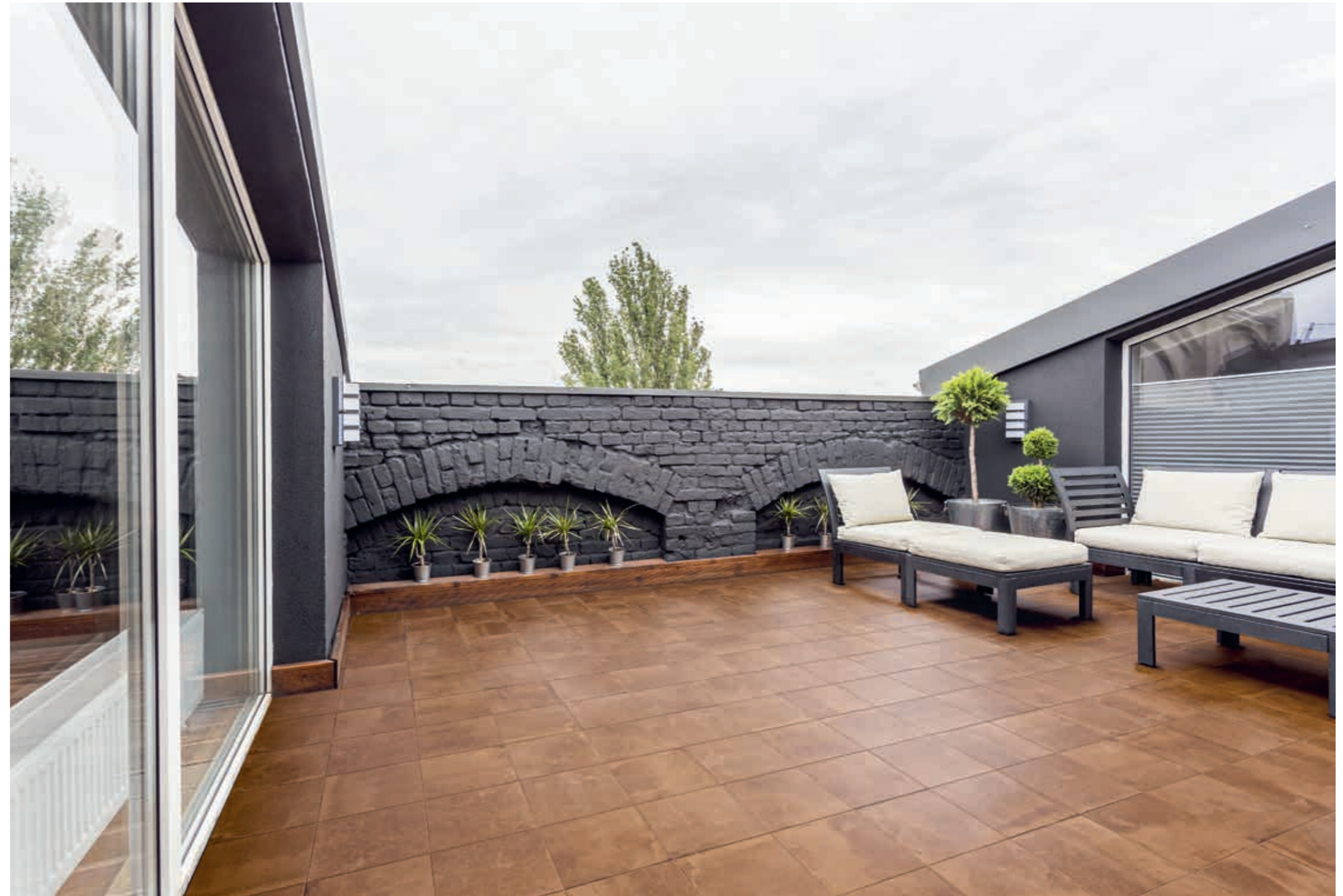
Cotto Red 33x33