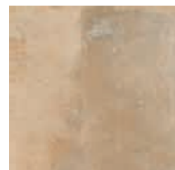
Cotto Beige Nat. 45x45 455x455mm P17