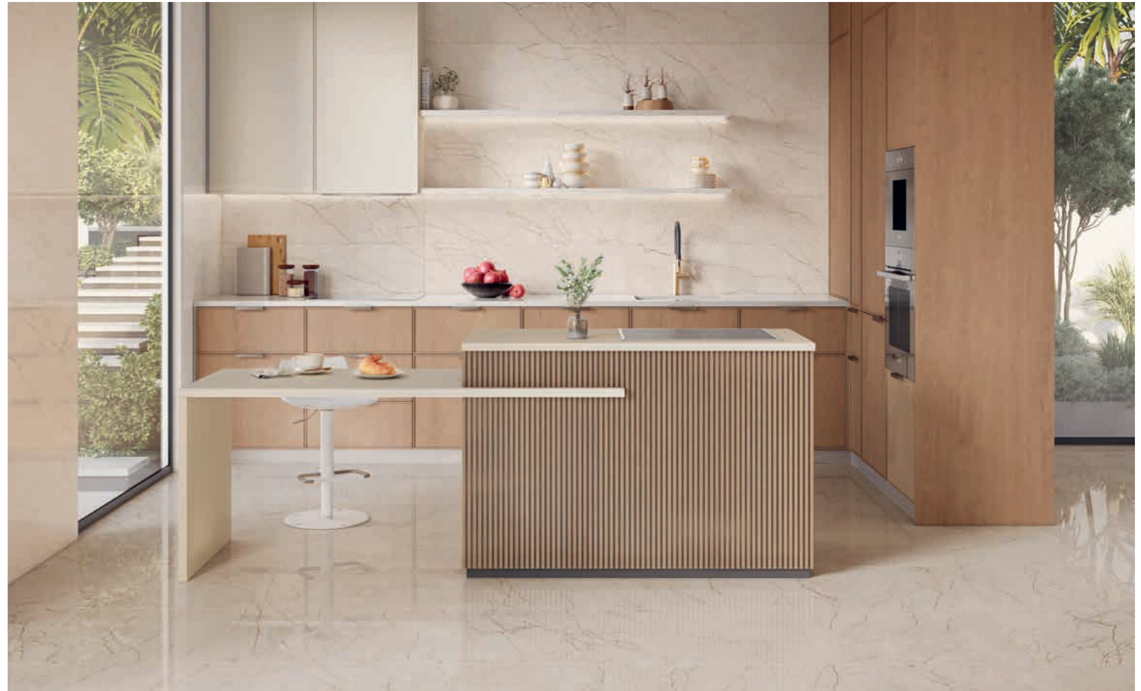
Alpine Polished 120x60R · Alpine Polished 60x60R