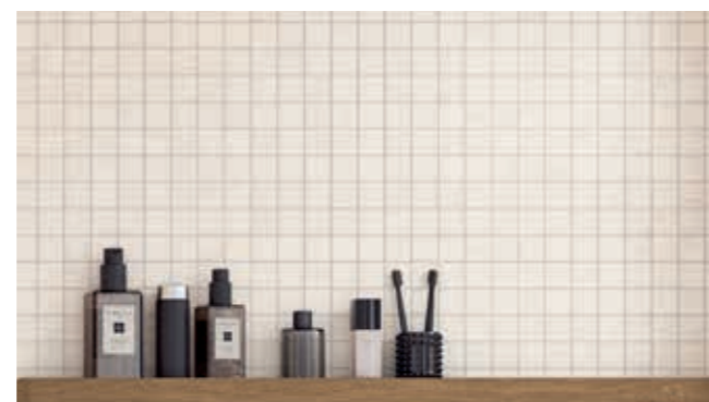
Mosaic Alpine (4,5x4,5) 30x30