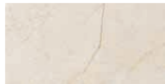
Alpine Nat. Polished 30x60 305x605mm P24 30x60R 298x598mm R20 R31